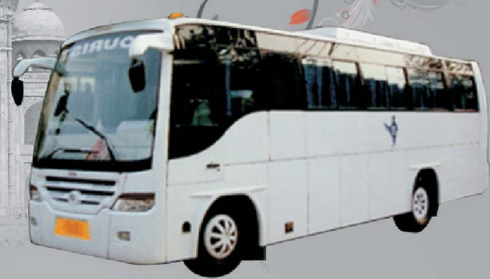
18/27 Seater Coach