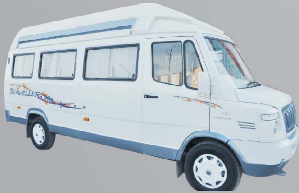
Tempo Traveller 9 / 12 / 16 Seater