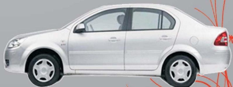
Ford Fiesta Car