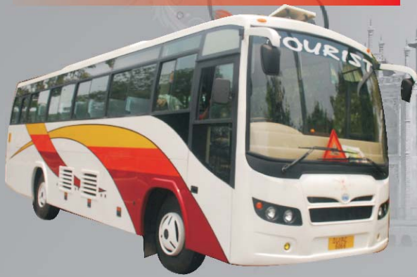
41 seater super deluxe